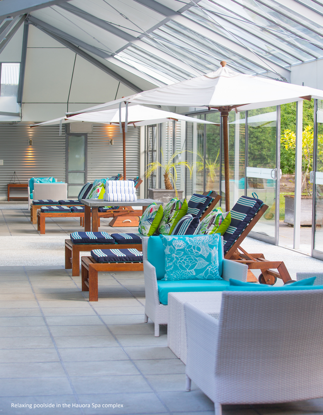
Relaxing poolside in the Hauora Spa complex