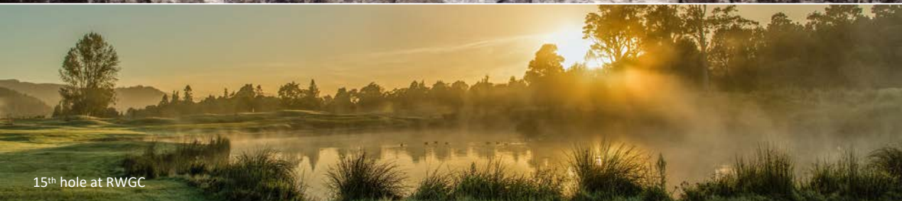
15 th hole at RWGC