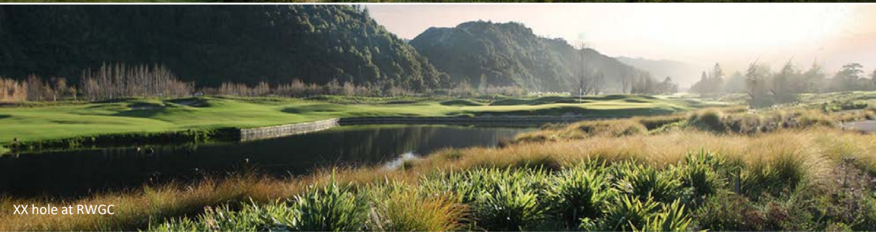
XX hole at RWGC