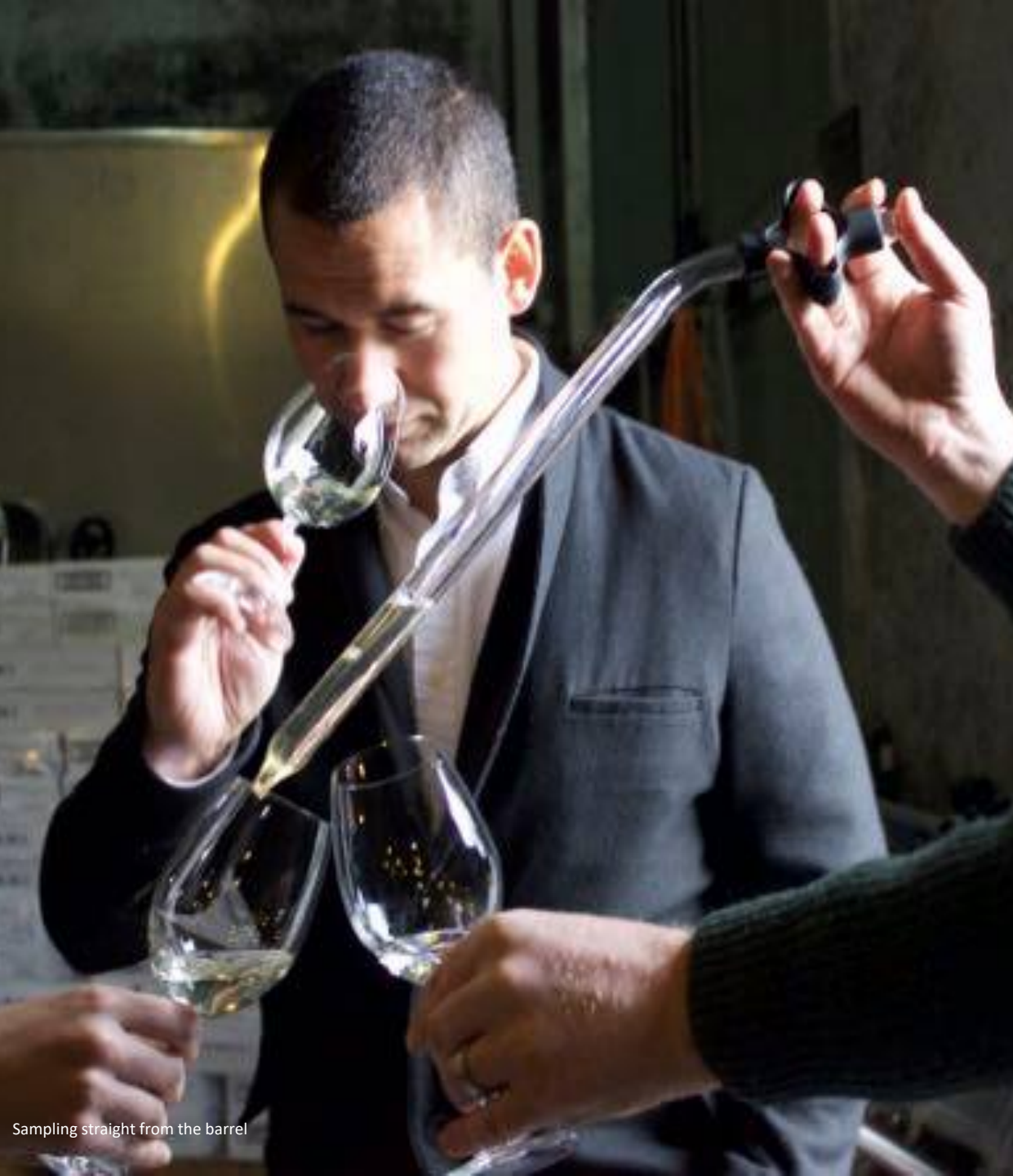
Sampling straight from the barrel