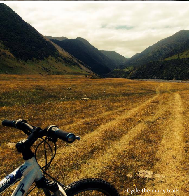
Cycle the many trails