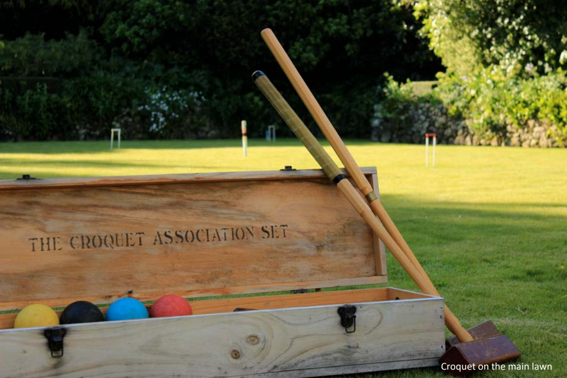
Croquet on the main lawn