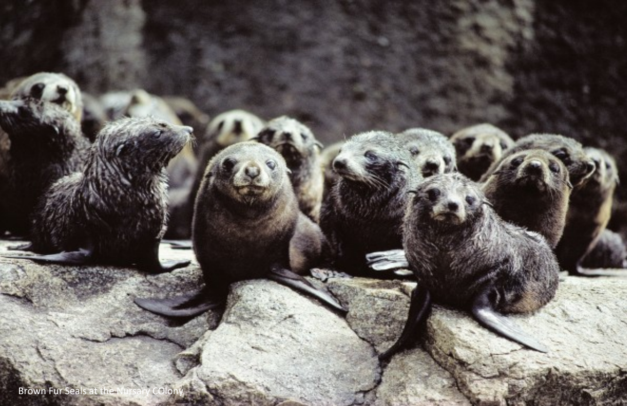
Brown Fur Seals at the Nursery Colony